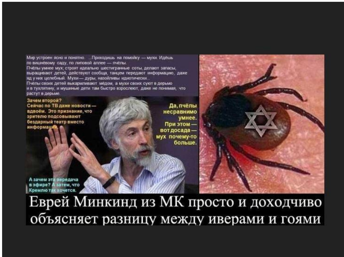
A post against Jews with the photo of a leech compared to Jews