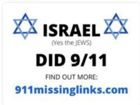
5:10 PM - Sep 10, 2021 - Twitter for Android