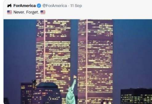
6:55 am - 12 Sep 2021 - Twitter for Android

Never forget.....the CIA, Mossad, Israel, communist Jews did 9/11! That is what America needs to remember!